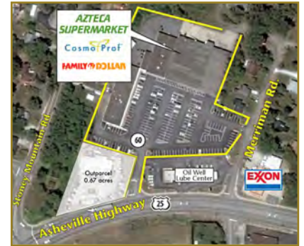
Plaza Fiesta 2111 Asheville Hwy Hendersonville, NC 28791