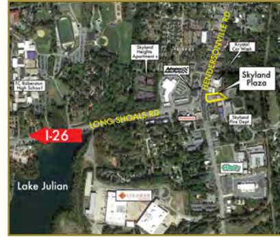
Skyland Plaza 5 Miller Rd S Asheville, NC 28803