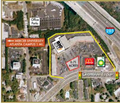
North Hills 3350 Chamblee Tucker Rd. Atlanta, GA 30341