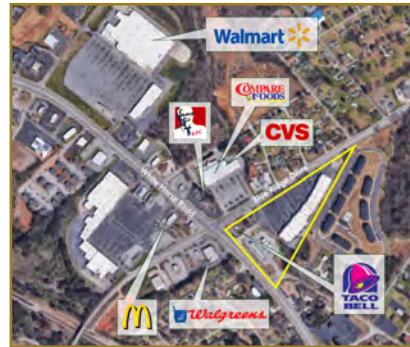
Western Square 3229 W Blue Ridge Dr. Greenville, SC 29611