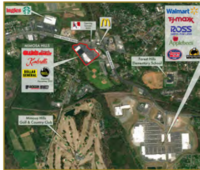
Mimosa Hills 915 W Union St. Morganton, NC 28655