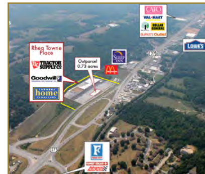
Rhea Towne Place 200 Able Dr. Dayton, TN 37321