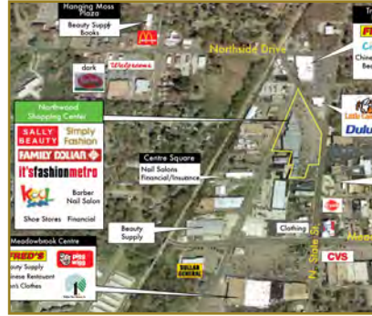
Northwood Shopping Center 4429 N State St. Jackson, MS 39206